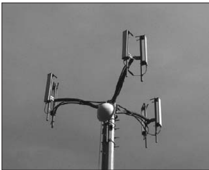
Figure 1. MIMO (a tri sector 2x2 mast)

MIMO (a tri sector 2x2 mast shown in Figure 1) uses multiple antennas to send multiple parallel signals. The receiving end uses special signal processing to sort out the multiple signals. The benefit here is two-fold: firstly, use of parallel streams makes for a scalable enhancement (more antennas means more capacity) and secondly, the MIMO approach makes use of multi-path effects such as reflections off buildings, so MIMO works well in cluttered environments, e.g. urban settings. MIMO base station antennas can be standard, off-the-shelf components, which helps contain cost. Nortel has been working with MIMO technologies for many years, but it is only recently that the cost of the required signal processing has become attractive.