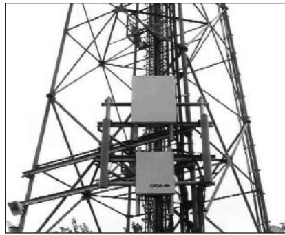
Figure 2. AAS (a typical AAS antenna)

AAS (a typical AAS antenna shown in Figure 2) uses a different approach. It also uses an array of close spaced antennas often enclosed in a single package. The AAS approach uses a technique known as beamforming and generates a single beam aimed at a particular user or device. This provides a stronger link to the user and hence improves reach and capacity. The solution can cope with multiple users by steering the beam